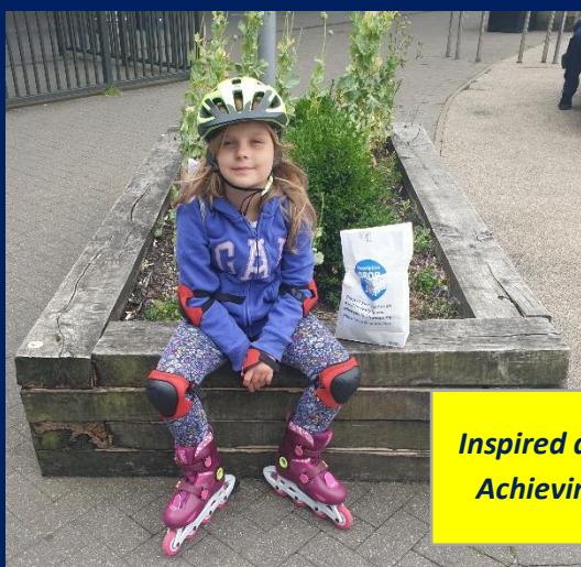
Inspired and Achieving