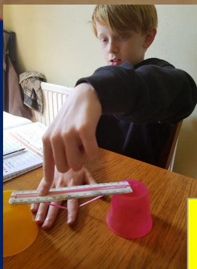
Inspired and Achieving