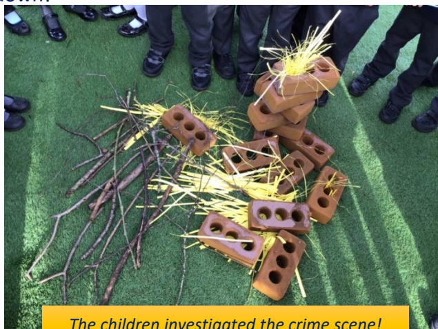
The children investigated the crime scene!

We have started a new story - The Three Little Pigs. On Monday we had a letter delivered to us telling us to be careful outside - we discovered a crime scene of materials which had been blown down!